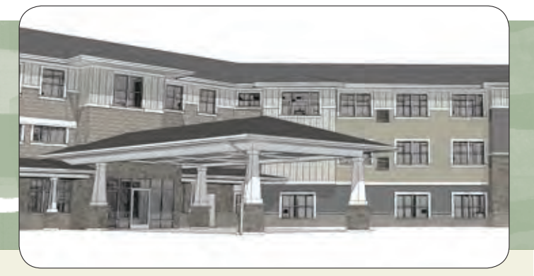
Brookside Senior Living's new building will allow Augustana Care to expand its services in Montevideo to include memory care.