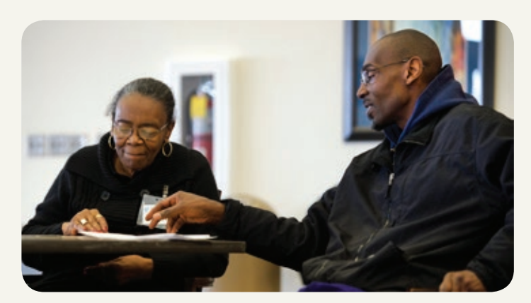
Augustana Care is working with the city of Hopkins and other partners to create a more dementia-friendly community and help people with memory issues stay at home longer.

An action team will choose the three largest areas of concern and work to find solutions. Those solutions might include creating easy-to-navigate environments in local buildings, or training community members on how to talk to people with dementia.