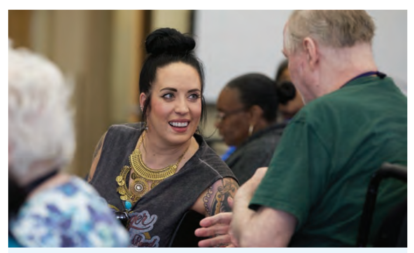
Guest singers like Kat Perkins (featured on The Voice) add intergenerational perspectives to our singing group while celebrating the exceptional talents of older adults.